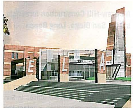
The project will incorporate green elements

WWCOT was selected as the designer for the $12.8 million Student Services Center